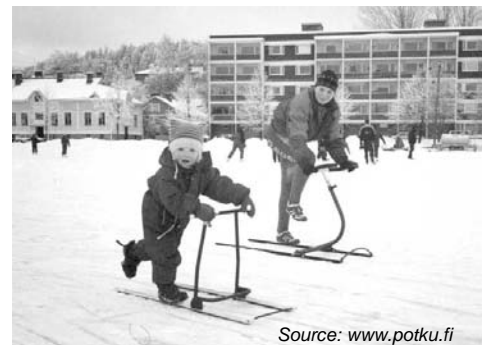
Kicksledding in Finland gets all ages out enjoying winter weather