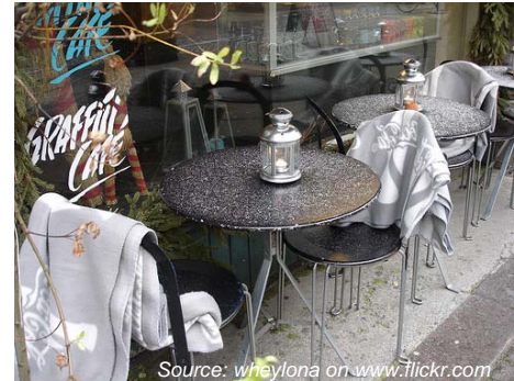
An outdoor café in Sweden provides a 'warm' touch for customers